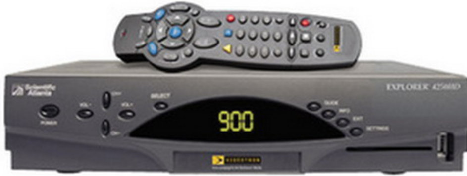
Cable Box & Remote, New York City, circa. 2010